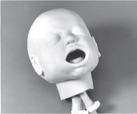
LF03621U Infant Airway Management Trainer Head

Landmarks include: gum line, tongue, oral and nasal pharynx, larynx, epiglottis, arytenoids, false and true vocal cords, cricoid ring, tracheal rings, trachea, esophagus, lungs, and stomach. NASCO's Infant Airway Management Trainer allows you to practice oral intubation, and suction techniques can also be performed and evaluated. The simulator was designed to use an uncuffed endotracheal tube measuring up to 4.0 mm I.D.