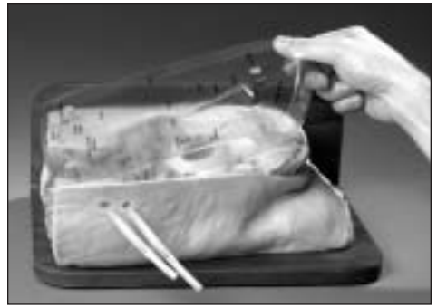
Figure 5 Cautions

Solvents or corrosive materials will damage simulator. Never place simulator on any printed paper or plastic. These materials will transfer indelible stains. Ball-point pens will also make indelible stains.